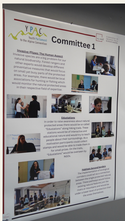
The exhibition and the discussion